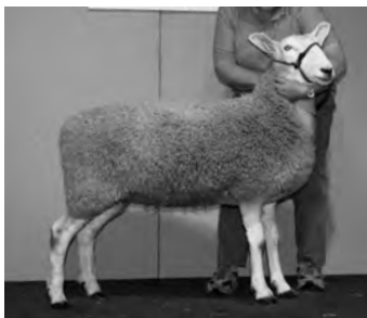
Mistwood Farm's Reserve Champion Border Leicester Ewe sold to Cinderella Farm, TN.

Lot 54 S Patti 3AF 14-06 18861 B-3/4/14 Tw S-Vast Plains 210 15981 D-P Hopkins 936 15052 Service Sire: "Tiger" P Hopkins 825 14301