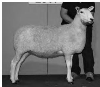
GINLIP Farm's Champion Border Leicester Ewe sold to Cinderella Farm, TN.