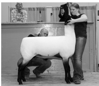
MacCauley Suffolks' 1st Fall Ewe Lamb sold to Knapke Suffolks, OH.

If you can't make the sale... Plan To Be Represented With A Mail Bid!