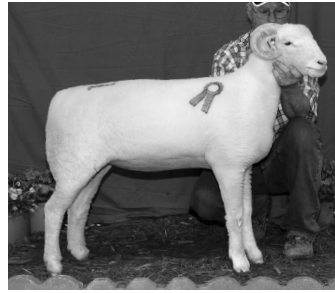
Kendrick Horned Dorsets, IL Champion Ewe sold to Houfe Dorsets, WI.

Lot 42 Ewe Rick Grimme 248 708027 B-11/6/13 Tw S-Spring Hill Farms 0825 694639 D-Rick Grimme 118 651818 Good long ewe lamb. Dam is our best ewe.