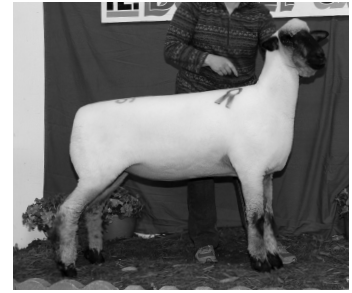
Grand Champion Oxford Ewe from Reid Family, MO sold to Daniels Oxfords, IL.

Lot 54 Ram Darlington 'Downs 361 B-10/3/13 S RR NN S-WSFS 0056 ET Y4657 RR NN D-Darlington 'Downs 218 Z4715 We like to bring fall born lambs to this sale as they always seem to have lots of friends. This ram lamb should be no different. He is straight, correct, big topped, with plenty of breed type. Sire is by "Old School". Check our website for updates.