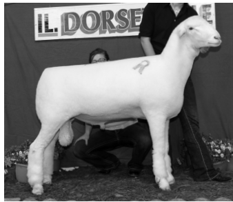
Grand Champion Dorset Ram from Moore Dorsets, IL sold to Cordray Dorsets, IL.

Full sister to the first place September ram lamb at last year's sale. Both yearling ewes are April born but show a lot of potential.