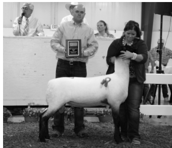
Best Consignment Award Winner at the 2013 Illini Spring Sale was won by MacCauley Suffolks, PA.

Lot 138 Ram Hoskins 13-29 B-3/14/13 S RR NN S-Mountain Pup Ruby Mt 1155 D-Hoskins 12-36