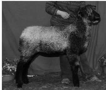
Grand Champion N.C. Lincoln Ewe from Wyncrest, MO sold to Clifford Sheep Connection, CA.

Lot 90 Spring Ewe Lamb Information Sale Day S-Reid 12-071 "Black Tea" These two ewe lambs will be futurity nominated. They are out of "Black Tea" who was Champion Ram at Louisville 2013 and pulled for the select four bucks in the Supreme Drive at Louisville. This will be the first offering of his lambs.