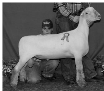
Darlington Downs, WI Champion Ram sold to Rogers & Goins, IN.