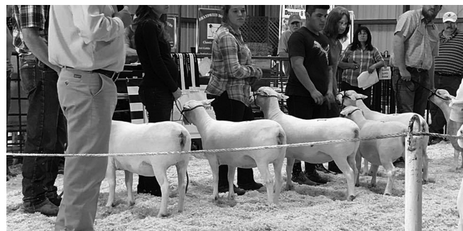
Both Breed-Building Dorpers and White Dorpers Sell at the Western States Dorper Sale!