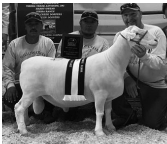
Grand Champion White Dorper Ram was consigned by Willow Creek Ranch, CA and sold to Blackburn & Smalley Livestock, UT.